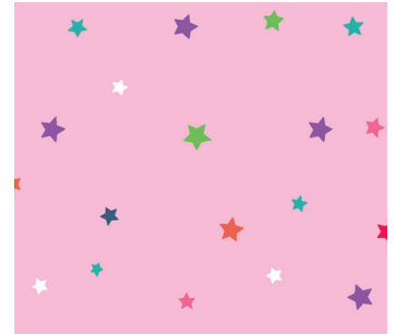
2274/P Multi Stars