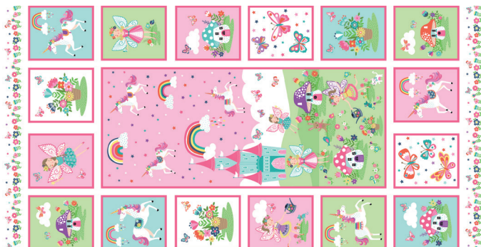
2282/1 Panel - Each panel (60 x 112cms) 24" x 44"