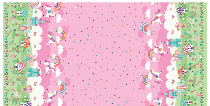
2281/1 Double Edge Border (WOF shown above)