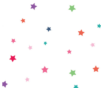
2274/W Multi Stars